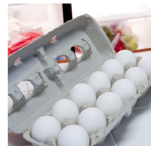
Dairy & Eggs